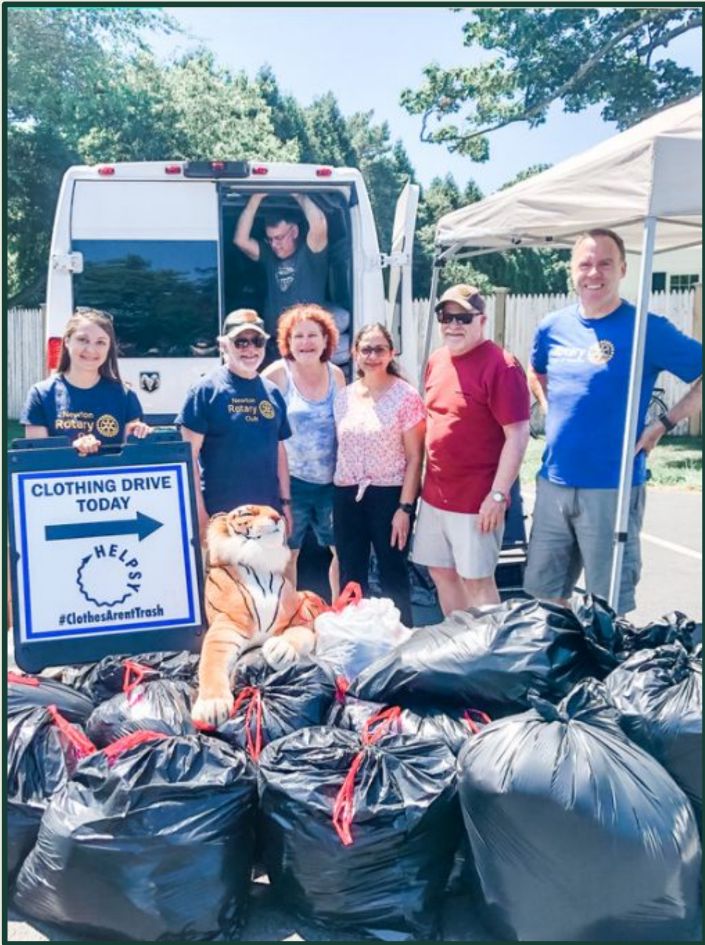
Clothing Drives Fundraising opportunities for community organizations.