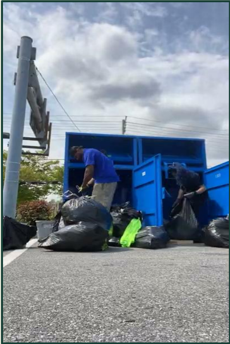
Bins The classic collection method.