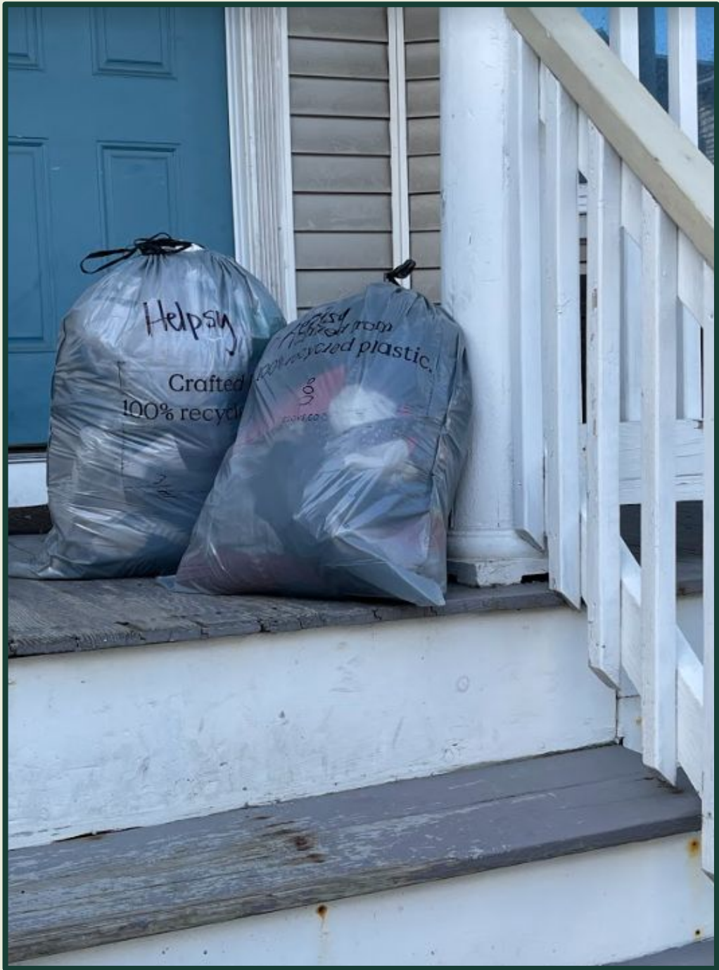
Home Pickups Free service offered in select municipalities.