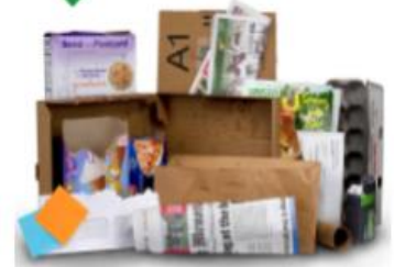
Paper & Cardboard