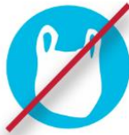
No Plastic Bags or Plastic Wrap (return to retail)