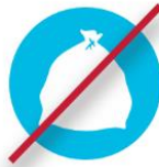
Do Not Bag Recyclables No Garbage