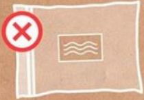
Plastic shipping bag