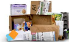
Mixed Paper, Newspaper, Magazines, Boxes empty and flatten