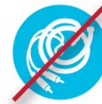
No Tangles (no hoses, wires, chains or electronics)