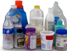
Bottles, Jars, Jugs and Tubs empty and replace cap