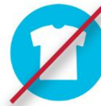
No Clothing or Linens (use donation programs)