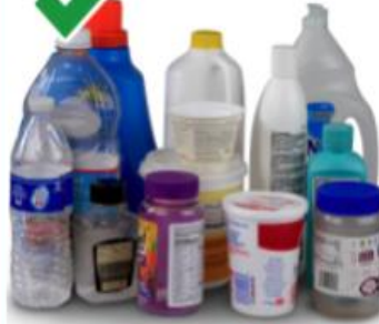
Plastic Bottles, Jars, Jugs & Tubs