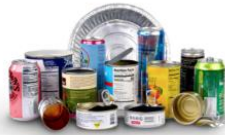
Food and Beverage Cans empty and rinse