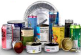
Metal Food & Beverage Cans