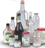
Bottles and Jars empty and rinse