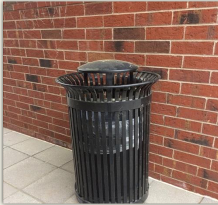
Outdoor dual recycling and trash receptacles