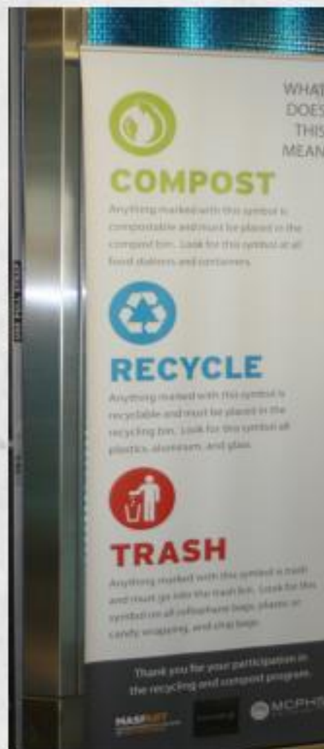
A large banner at the cafeteria entrance introduces the waste streams with color-coded icons