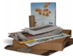
Mixed Paper, Newspaper, Magazines, Boxes empty and flatten