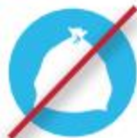
Do Not Bag Recyclables No Garbage