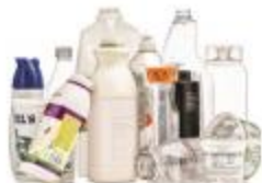
Bottles, Jars, Jugs and Tubs empty and replace cap