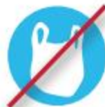
No Plastic Bags or Plastic Wrap (return to retail).