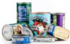
Food and Beverage Cans empty and rinse