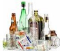
Bottles and Jars empty and rinse