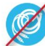
No Tangles (no hoses, wires, chains or electronics)