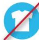
No Clothing or Linens (use donation programs)