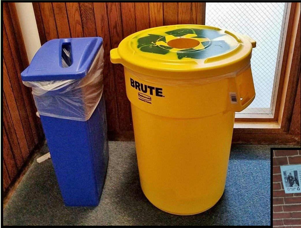
Dorm (Res Hall) Standard