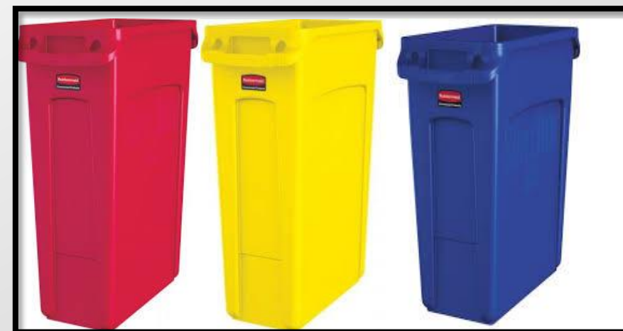
Level 2 – New!