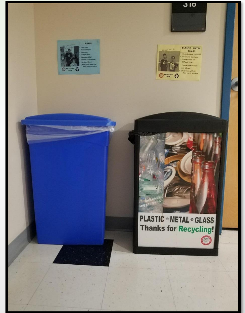
Academic Building Standard