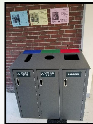
Level 1 - same