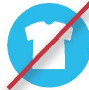
No Clothing or Linens (use donation programs)