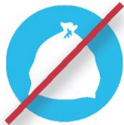
Do Not Bag Recyclables No Garbage