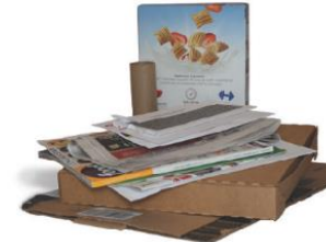
Mixed Paper, Newspaper, Magazines, Boxes empty and flatten