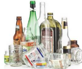
Bottles and Jars empty and rinse