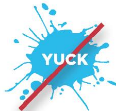
No Food or Liquid (empty all containers)