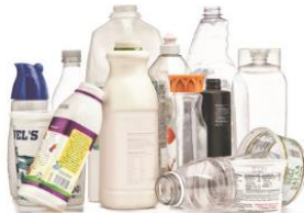
Bottles, Jars, Jugs and Tubs empty and replace cap