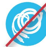
No Tanglers (no hoses, wires, chains or electronics)