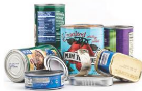
Food and Beverage Cans empty and rinse