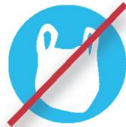
No Plastic Bags or Plastic Wrap (return to retail)