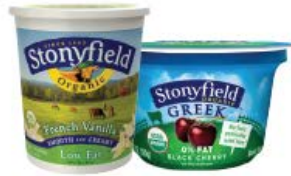
stonyfield® yogurt containers and other #5 containers