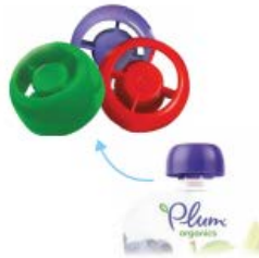
plum organics® caps and similar pouch caps