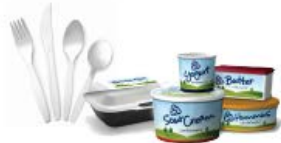
#5 plastic utensils and containers