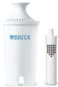
brita® pitcher and bottle filters