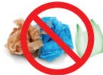
NO #5 plastic bags please use designated bin