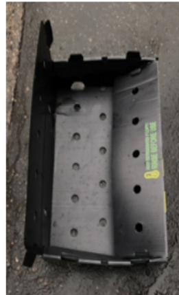
Asparagus, Bean or Pea Boxes – #5