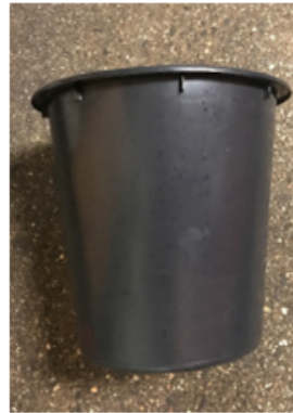
Flower Pots – #5