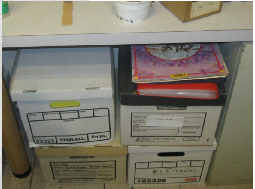
Store records and paperwork can be recycled, maximizing diversion and significantly decreasing disposal costs.