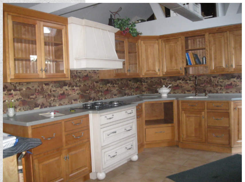
High quality items can be sold for a profit while decreasing disposal costs.

Inventory: RecyclingWorks staff visited Century Kitchen's showroom and identified diversion outlets for a number of different materials. Some items in stock had significant resale value, such as kitchen and dining sets and assorted appliances such as stoves and ovens. Other items – chairs, desks, filing cabinets and shelving – had potential for reuse for their intended function. The remaining assortment of countertop and tiling samples, cabinetry pieces and various oddments had value as replacement parts and material for artistic reuse and do-it-yourself projects. A large amount of paper from store records and magazines was also present, in addition to the binders that held them.