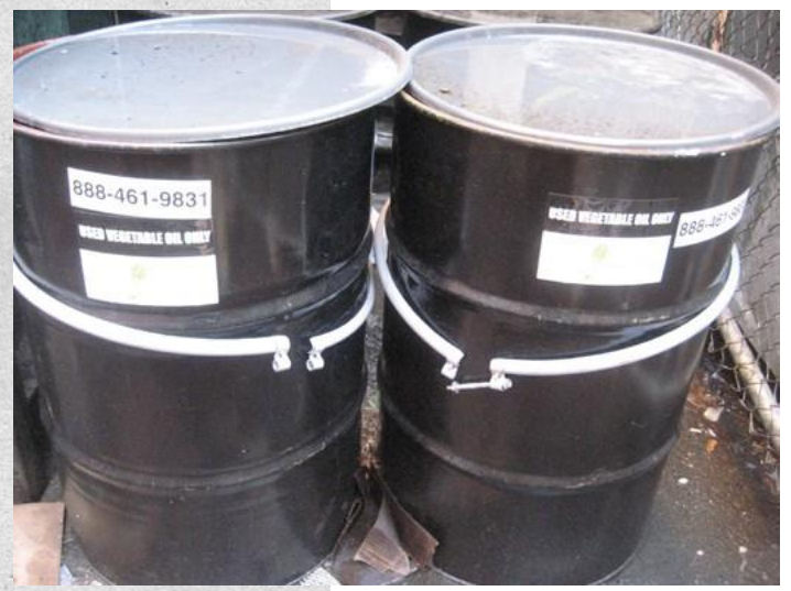
Used vegetable oil collection

and improve their environmental and social impacts. In addition to the organics program, Clio recycles cardboard, paper and commingled containers. The hotel and restaurant have reached a diversion rate of 42%.