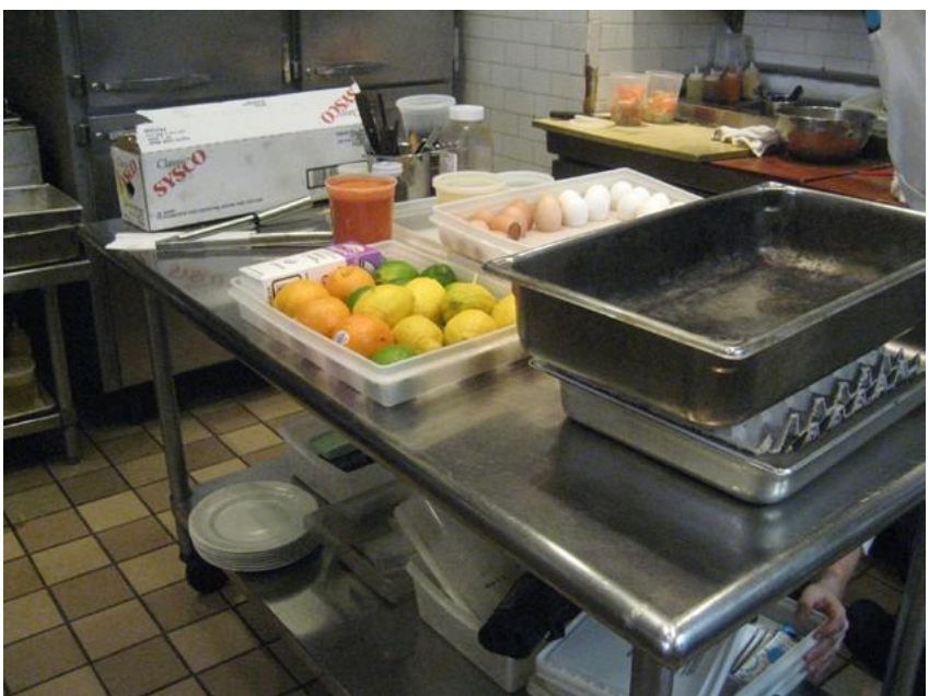
Clio Restaurant sorting station (left) and prep area (above)